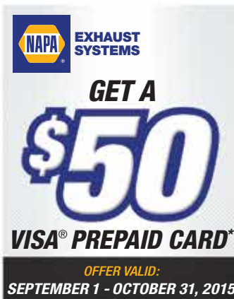
3-column x 5 inch ad

* Cards are issued by Citibank, N.A. pursuant to a license from Visa U.S.A. Inc. and managed by Citi Prepaid Services. Cards will not have cash access and can be used everywhere Visa debit cards are accepted. CARD EXPIRES 12 MONTHS FROM ISSUE, FEES APPLY. SEE CARDHOLDER AGREEMENT FOR COMPLETE TERMS, CONDITIONS AND FEES.